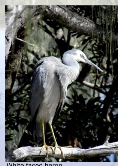
White faced heron